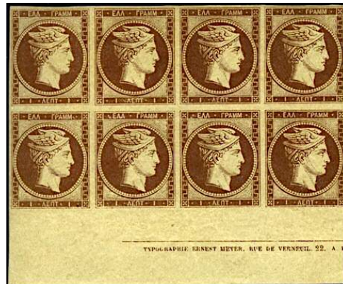
Figure 6: The first of the three blocks of eight of the 1 lepton (EM1a)