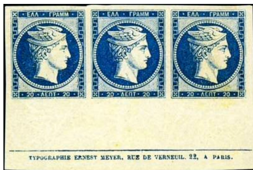
Figure 1: The strip of three of the 20 lepta (EM5c), the first picture of an imprimatur with the printer's inscription to appear in the philatelic literature, in 1897

Starting with the publication of this study, in 1897, and the discovery of this strip of three 20 lepta, a big debate has divided the community of lovers of this marvellous stamp: who was the printer of the large Hermes head stamps in Paris, Anatole-Auguste Hulot 10 or Ernest Meyer?