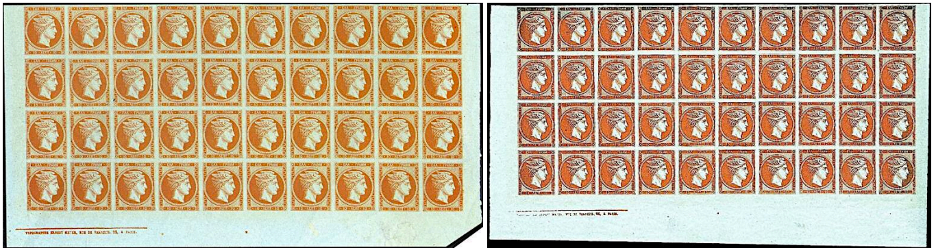
Figure 4: The two blocks of forty of the 10 lepta, with “Control Numbers” (EM 4a), and without “Control Number” (EM4A), Constantin Mattheos’ collection

The nine items shown above (Figures: 1, 2 & 3) are imprimaturs being issued from first sheets printed when the press starts to print. Below are presented all the other known imprimaturs with the printer's imprint: