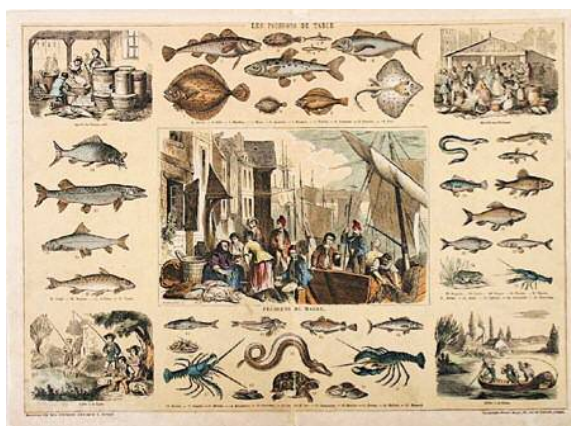
Figure 10: Gravure "Les Poissons de Table - Les Pêcheurs de Marée" with Ernest Meyer's imprint, (real size: 272 X 380 mm), 1850

This same inscription also exists on gravures (figure 10, below) and on books printed by Ernest Meyer in France, in the middle of the 19 th century 30 .