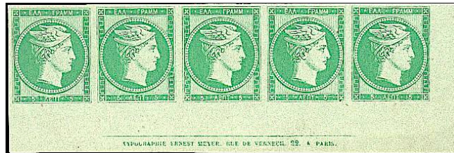
Figure 5: The strip of five of the 5 Lepta (EM3a) - Stavros Andreadis’ collection