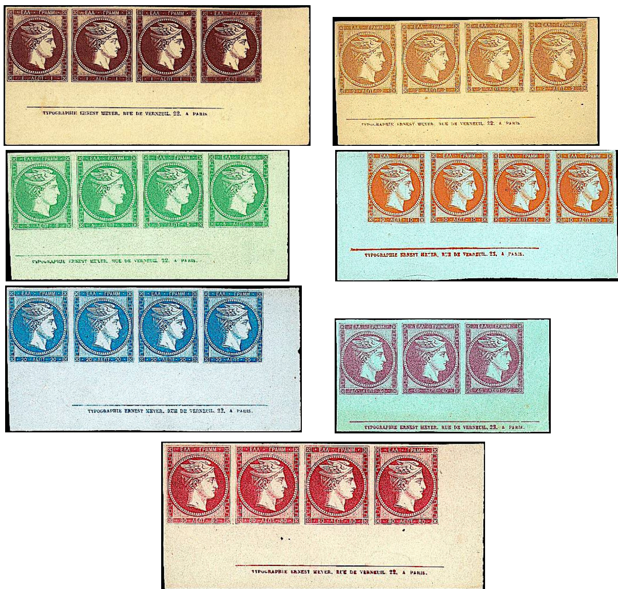
Figure 3: The complete legendary set of the Large Hermes head imprimaturs strips of the seven values, with the printer's inscription (EM1, EM2, EM3, EM4, EM5, EM6 & EM7)

Finally, the last time the complete set appeared on the market was during the sale of the Zachariades' collection 25 , and belongs now to a new happy collector.