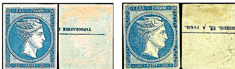
Figure 9: The two single essays of the 20 lepta, printed recto/verso, with partial printer's inscription (EM4a & EM4b)