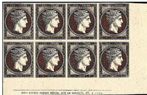
Figure 7: The second of the three blocks of eight of the 1 lepton (EM1b)

Several other known items come from sheets used as essays 26 during the calibration of the printing press. They are generally of coarse quality of printing, and sometime printed recto/verso.