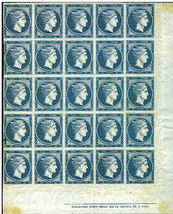
Figure 2: The famous Alfieris block of twenty-five of the 20 lepta with the printer's inscription (EM5d)

20 & 80 lepta) had traces of the horizontal line above the printer's inscription after the bottom part of the sheets had been cut with scissors. Three of these sheets (5, 20 & 80 lepta) are part of the Andreadis' Kassandra collection and can be seen in the Edition d'Or book 17 . This is another big debate among the community of the large Hermes head specialists since ages: Were the 8,962 18 complete sheets sent to Athens in August & September 1861 printed with the Ernest Meyer's imprint, and then cut at the bottom before their sending to Athens or were they printed without any printer's inscription after the removal of the imprint line from the typographic plate before the printing of the of the issued stamps...? As not any single official document on the relation between Désiré-Albert Barre and Ernest Meyer has been discovered, so far, and after the find of these 4 sheets with traces of the printer's imprint we can only suppose that one of these two hypothesis is the right one... 19